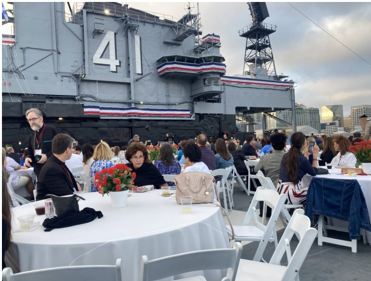
Thursday Night Banquet Dinner on the Lawn