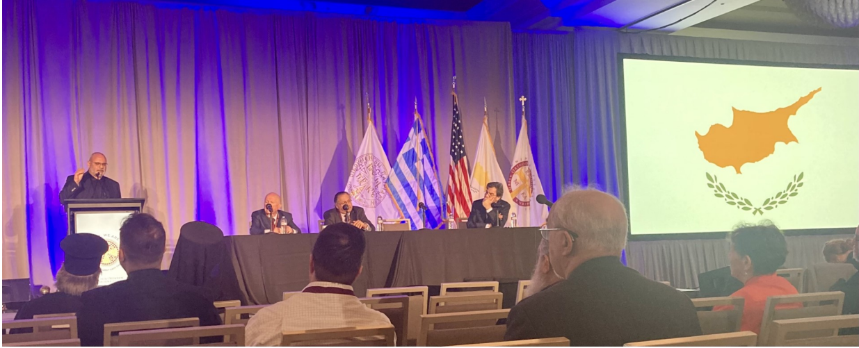
Session on 50th Anniversary of the Invasion of Cyprus