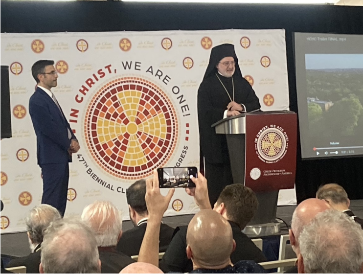
His Eminence Archbishop Elpidophoros Opening the conference