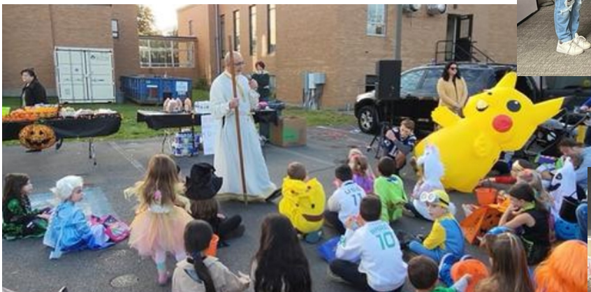
Trunk or Treat