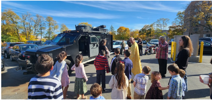
Blessing of the Vehicles