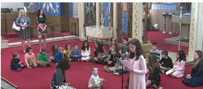
Joshua Fought the Battle of Jerico!