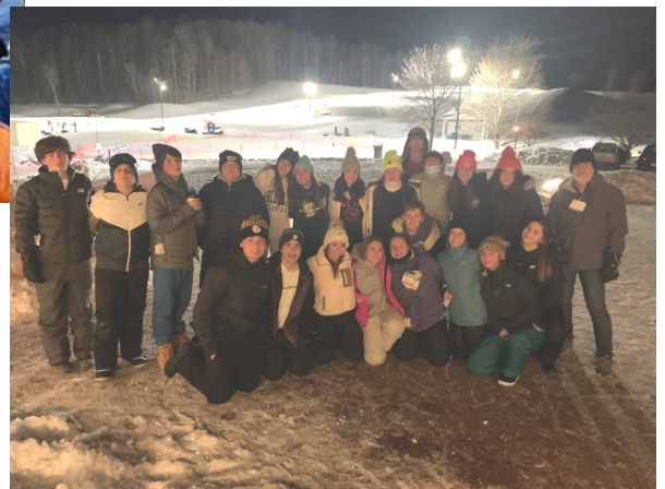
GOYA Snowtubing at Greystone