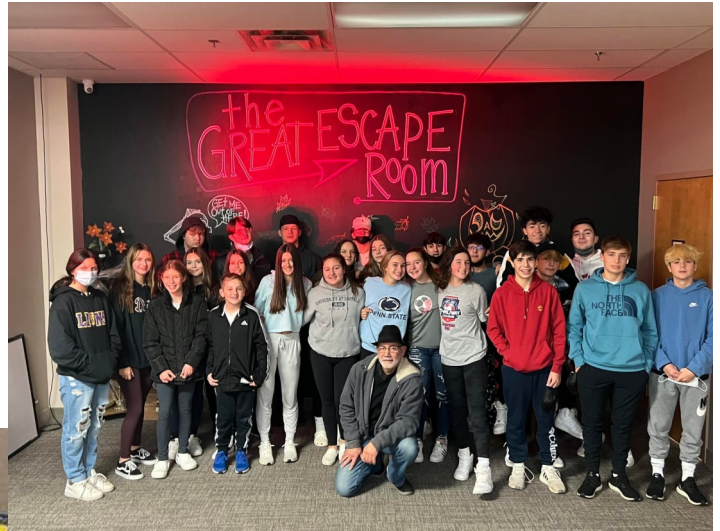
GOYA Great Escape Room