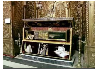
Reliquary of St Dionysius of Zakynthos

And speaking of Edessa, there is also the Orthodox tradition of King Abgar ruler of Edessa being healed by the Holy μανδύλιον (towel or napkin) of Christ as recorded by Eusebius, in his history of the Church.